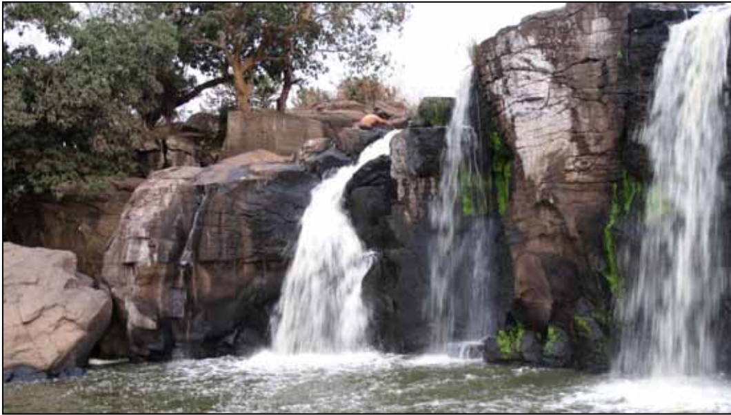
Ikiwa waterfall, Kathita River, Kenya

This Article provides an opportunity to advocate that community customary governance systems, based on Earth Jurisprudence principles, constitutes “good governance” which contributes to the “development of the law”. Accordingly the Constitution should be interpreted from such an Earth Jurisprudence perspective.