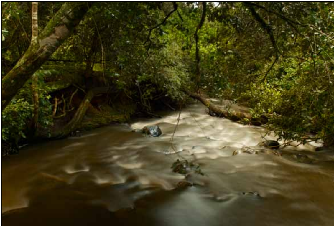
Burguret River, Nanyuki, which flows from sacred Mt Kenya

This Report examines whether the Constitution of Kenya 2010 and the legal, policy and institutional framework in Kenya recognises and supports, or undermines, the rights and responsibilities of communities to govern and protect their Sacred Natural Sites and Territories, according to their customary governance systems and on their own terms.