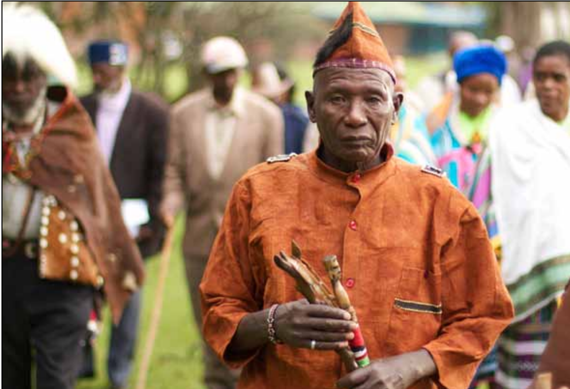
Gathering of African Sacred Natural Sites Custodians, in Nanyuki, Kenya