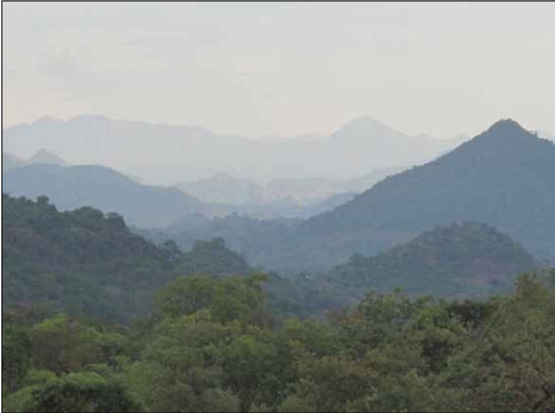
Kenya landscape: Tharaka District